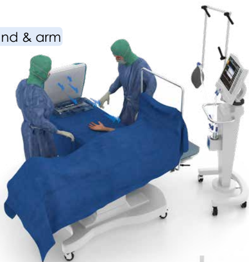
Hand & arm