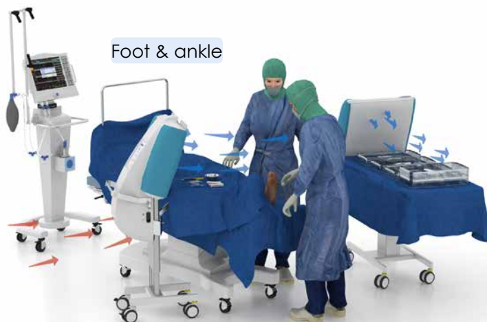
Foot & ankle