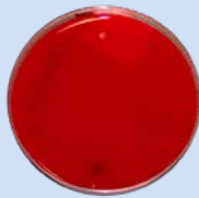
CFU on SteriStay instrument table