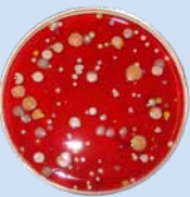
CFU on conventional instrument table

*CFU = Colony forming units, and represents bacteria. Typically, around 50-200 colony forming units per cubic meter (CFU/m 3 ) of air are found in conventionally ventilated operating rooms without Toul units.